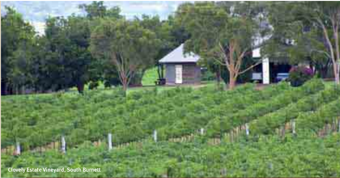
Clovelly Estate Vineyard, South Burnett