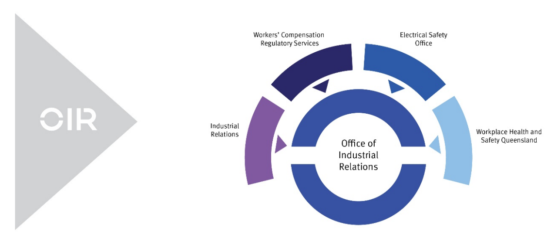
Figure 1: OIR - One office, four regulators

The Office of Industrial Relations (OIR) is a division of the Queensland Department of Education which comprises four regulators striving to achieve the vision of 'Queensland workers, industry and communities being healthy, safe, fair and productive'. Our purpose is to 'deliver contemporary regulatory and other government services to Queenslanders'.