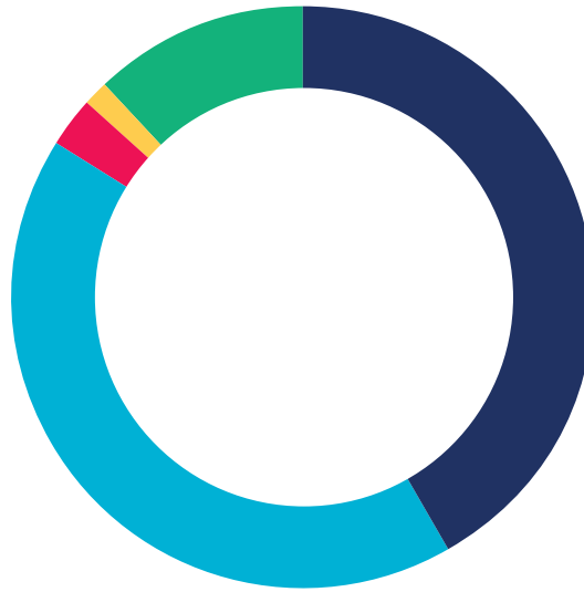
Total expenses by service 2018–19